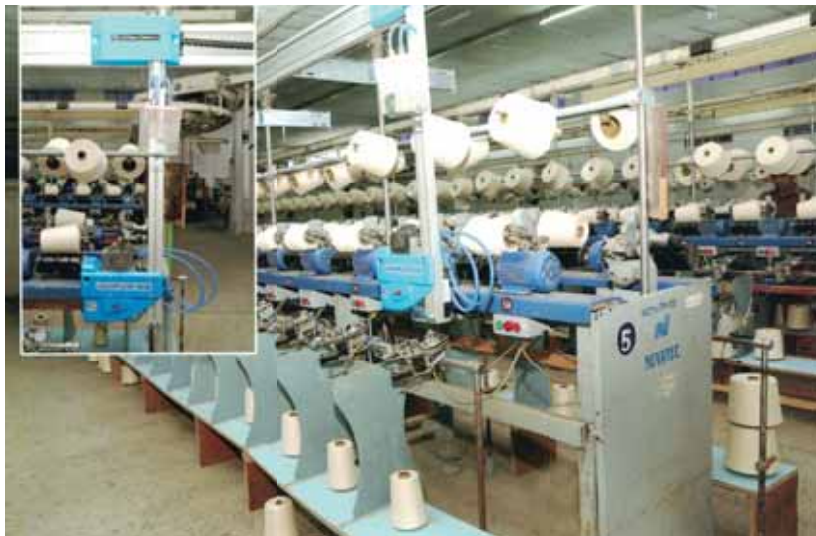
A view of the 'Mesdan Aqua splicer' attached in Nuvatec Rewinding Machine in our 'A Mill' at Rajapalaiyam.