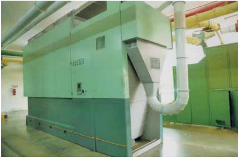
A view of the Rieter B71 Unimix Machine installed in our OE Blow Room at Rajapalaiyam.