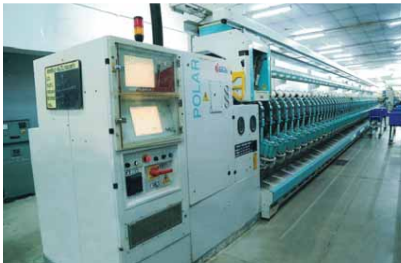
A view of the Savio Polar – L Auto Coner Machine installed in our 'A Mill' at Rajapalaiyam.