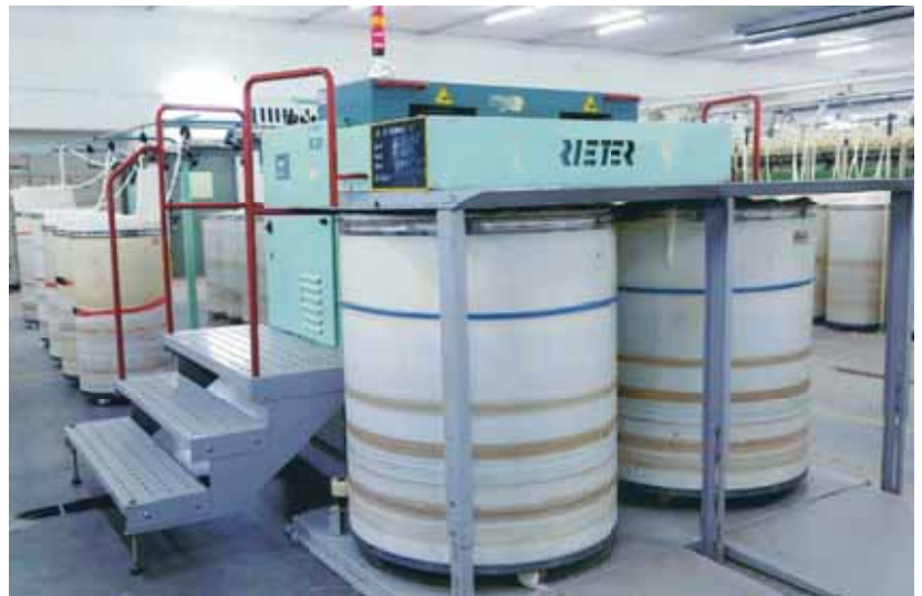
A view of the Rieter SB20 Drawing Machine installed in our 'B Mill' at Rajapalaiyam.